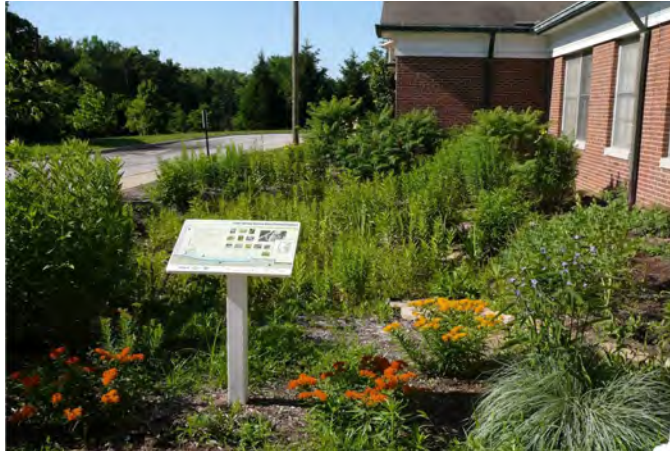
This IWF-certified schoolyard habitat, located at Cold Spring Environmental School in Indianapolis, functions as a living laboratory for students to learn and explore.

landscaping and protecting or restoring native habitats. 18 Landscape elements complementing the LEED certification program are indicated with an (*) in the PROGRAM CATEGORIES section (see page 10).