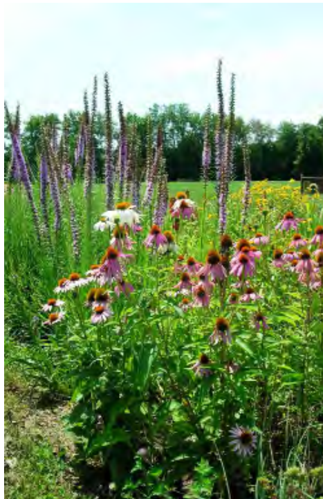
Raingardens filter stormwater, prevent erosion, and provide attractive patches of wildlife habitat.

Campuses that settle for conventional landscapes threaten the well-being of wild birds, fish, amphibians, and mammals. Turfgrass lawns, though aesthetically pleasing, do not offer a viable food source or habitat for many wildlife species. Native wildlife species need four essential resources: food, water, shelter, and a place to raise young in order to survive. As more wild space is converted to conventional landscapes, native plant and animal species lose these quality resources and face fierce competition from invading species.