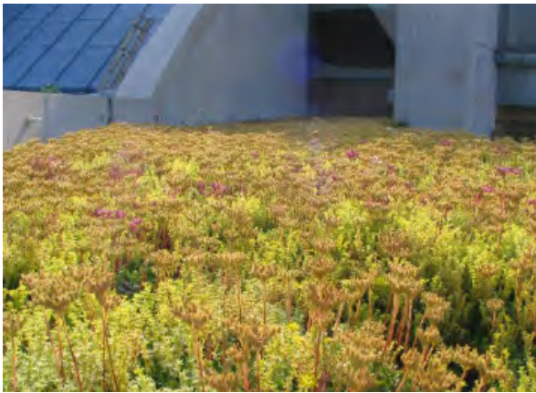
The sedum plants growing on this green roof in Muncie absorb stormwater and slow surface runoff. Green roofs naturally insulate and attract a variety of insects and birds.

water, largely affecting stream health. In a given watershed, impervious surfaces that cover as little as 10% of the land can cause stream degradation, according to the Federal Stream Corridor Restoration Handbook. In areas completely or three-fourths covered by impervious surfaces, 55% of the area's water becomes surface water runoff, whereas only 5% of the water deeply infiltrates the ground. Of the water in natural areas—areas with less than 10% of impervious surfaces—50% infiltrates the soil and only 10% becomes surface runoff. 10 This difference indicates the importance of pervious surfaces, critical in keeping sediment and water on land longer. Pervious surfaces function to both decelerate surface water runoff and mitigate the heat island effect.