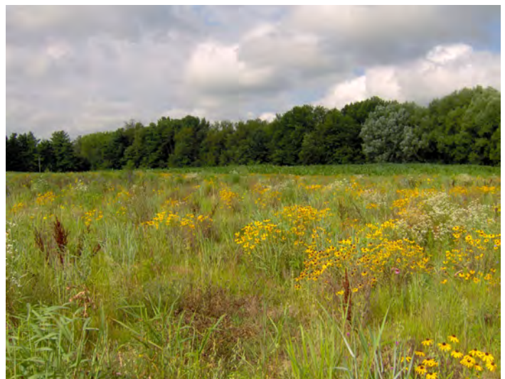
Prairies filled with native grasses provide invaluable wildlife habitat and do not require extensive maintenance.