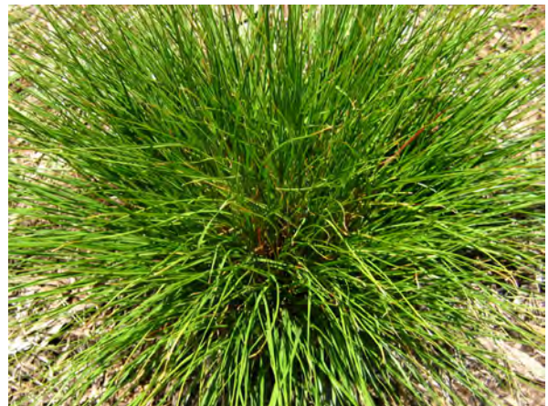
Grasses such as Prairie dropseed ( Sporobolus heterolepis ) are often used in prairie restorations, providing food and shelter for wildlife.

Schools will set goals and priorities depending on the level of certification they wish to achieve. A custom plan will be created based on the school's interests, needs, and resources. IWF will advise schools on which elements to incorporate into individual plans based on the current campus landscape. For schools that have already engaged in practices similar to those recommended by IWF, new or more advanced improvements to campus operations will be suggested. The flexibility of a customizable plan allows schools to work within their limitations and encourage project diversity among participating schools statewide. The project leaders and timeline will be set by the university staff.