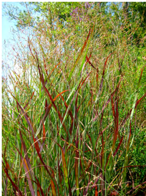
A tall, warm-season native grass, Switchgrass ( Panicum virgatum ) creates good habitat cover and nesting space for wildlife. Switchgrass helps manage soil erosion when planted in herbaceous buffers.

In Indiana, a state known for its subpar water quality, a concerted effort is needed to limit nutrient runoff into waterways from numerous sources such as agricultural, commercial, industrial, and urban areas. Due to noticeable increases statewide in algal blooms from nutrient overloading, it is imperative that individuals and institutions alike choose the right fertilizer and best land maintenance practices.